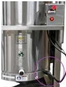
Connect The Plugs