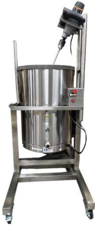
Place Pot on Stand